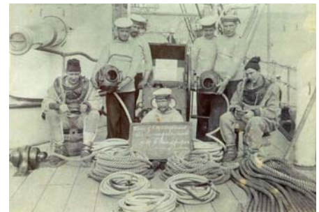
Argonauts crew diving on HMS Sandpiper in Hong Kong. HMS Sandpiper sank during a typhoon one man drowned. In the same storm a dredger and hundreds of Chinese junks capsised.