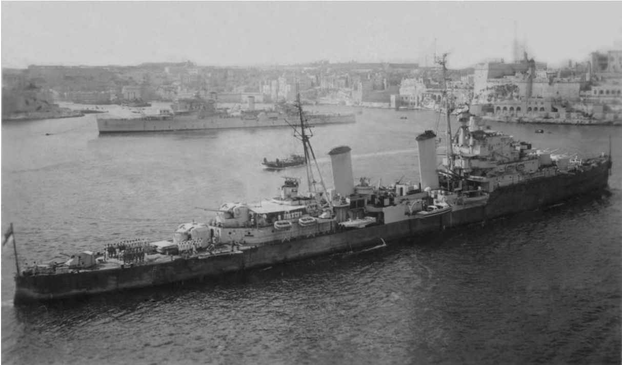
Dido Class Argonaut entering Malta. [Can you identify the ship behind her]