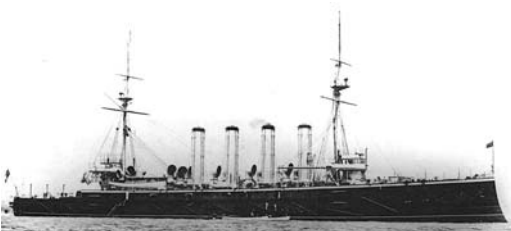
HMS Argonaut (not taken by Ernest)