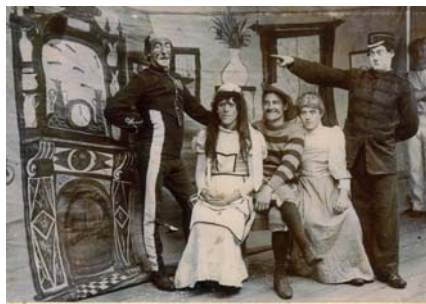
Argonauts Theatrical Party "Love in a Copper"