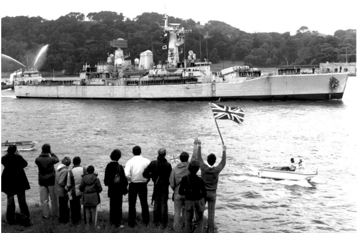
Leander Class Argonaut entering Plymouth after her voyage from the Falklands 1982. You can see the bomb damage just below the Exorcet.